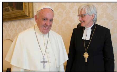
Bergoglio with a Lutheran Bishop-ette in Sweden. She probably believes more Catholic dogmas than he does and is certainly as validly consecrated as he is.