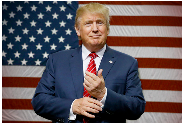
President-elect Donald Trump

At first I thought that Donald Trump, or any somewhat conservative Republican, for that matter, had no chance against the all-powerful Hillary Clinton. I thought that, as usual, the Republicans would put up an Establishment Republican who holds that in order to be elected you need to speak and act like a liberal.