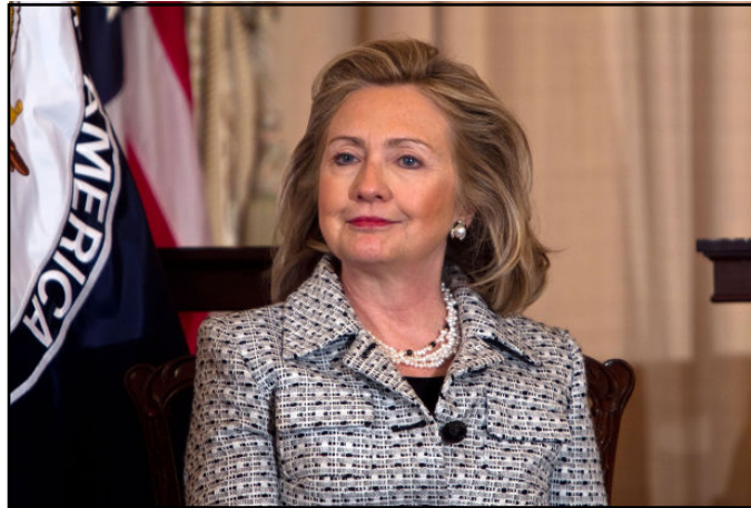
Bill Clinton's wife

Does this election mark a U-turn in American politics? I hope so, but I think not. The power of the liberal principle, which I described in my last newsletter, is massive. American culture and government are based on eighteenth-century liberalism, and I fear that it will be the liberals, in the