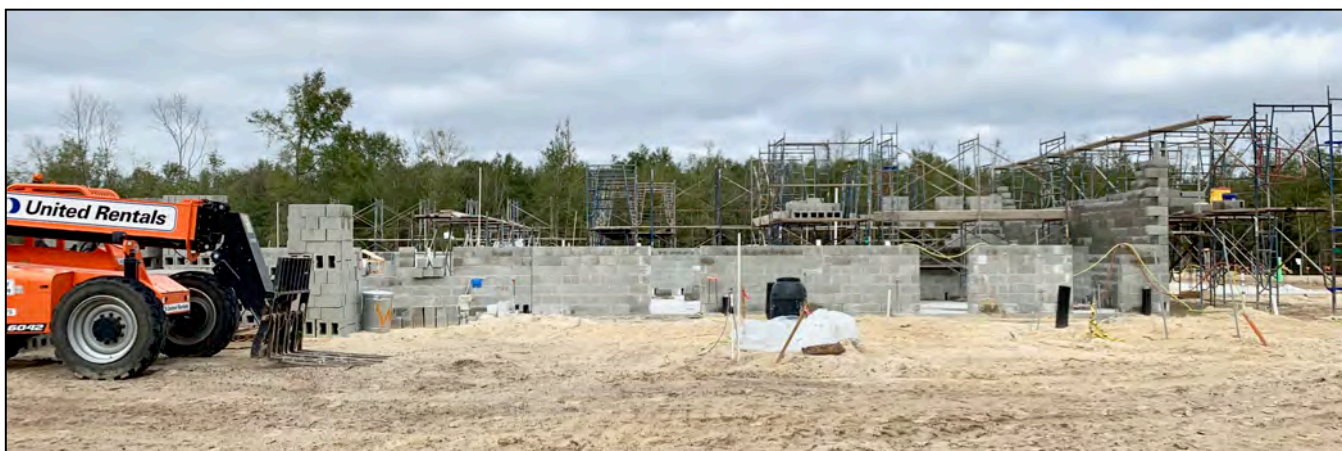
The Mother House under construction.

At long last the Sisters of Saint Thomas Aquinas are seeing their future home go up before their eyes. It has been in the planning stage since 2014.