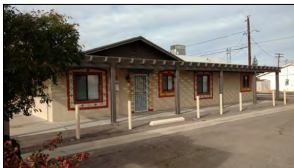
The new church in the Phoenix area.

Never as in the course of these recent years, since Jorge Bergoglio was elected (N.B.: only elected) to the papacy, have the voices been raised of certain members (materially) of the