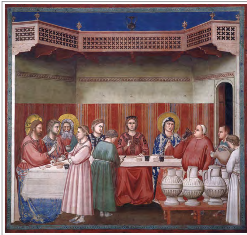
THE WEDDING FEAST OF CANA