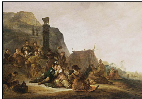
The worship of the Golden Calf