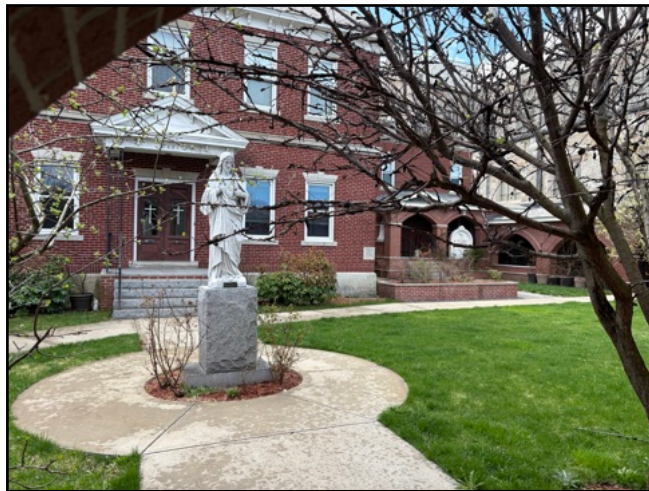
The cloister, with the rectory in the background.

And if at times there appears in the Church something that indicates the weakness of our