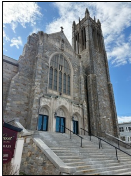
The front of Sacred Heart Church.

surmised that by spelling out everything clearly, conflict could be avoided. Furthermore, changes to these documents cannot be made by my own whim, but must be approved by a majority of the priest members.