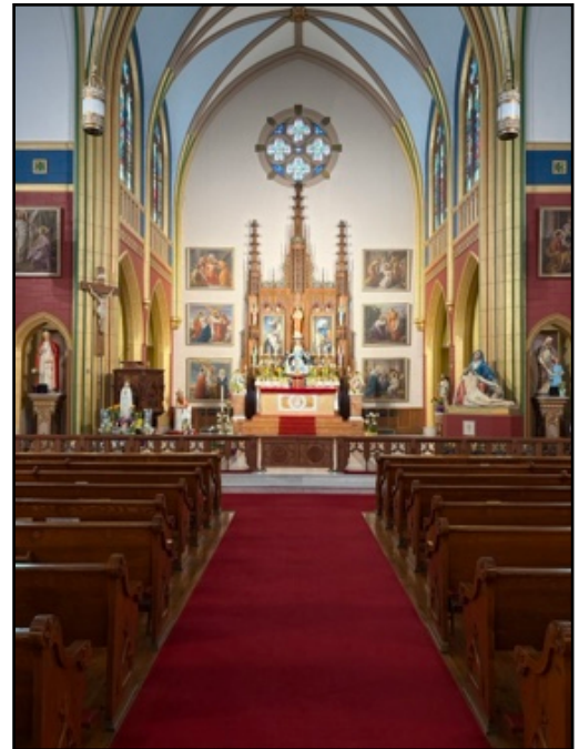
The interior of Sacred Heart church. Above: the main altar. Below: the nave and choir loft. Below left: The library of the rectory. The rectory has eleven bedrooms.