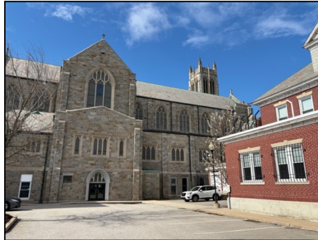
A side view of the church, showing the rectory.

Massachusetts is the second most Catholic state after Rhode Island, that is, by percentage of Catholics. The Boston area is loaded with people who call themselves Catholics, and for this reason, I believe that our presence in Sacred Heart will draw a large number of parishioners.